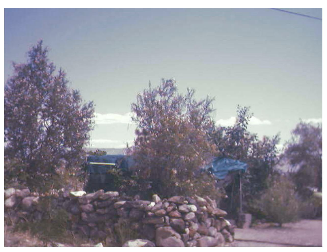
Jungle in the Desert: Trees 2 year growth!

The results have been phenomenal. Watch for additional pictures, and more information on this project in future articles.